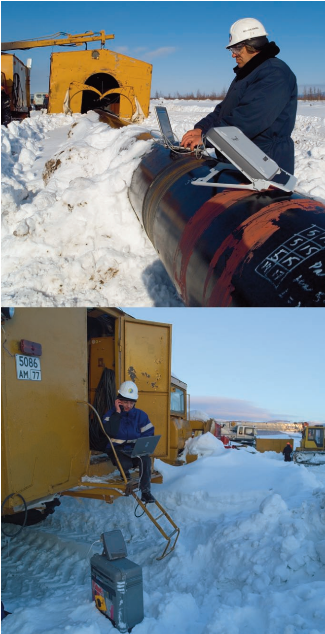
Figure 4. New mobile broadband satellite systems offer reliable connectivity in all weather conditions.

By providing near real time remote monitoring and control of in-field equipment and processes, these solutions can process the information about the hardware or operations being monitored (usually unmanned), with reports automatically generated and transmitted at set intervals.