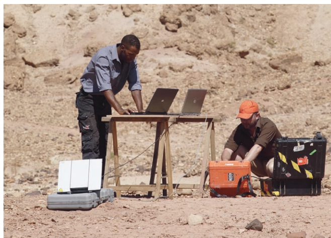
Figure 3. E&P professionals have deployed new mobile broadband satellite systems in areas where there is unreliable or nonexistent telecommunications infrastructure.