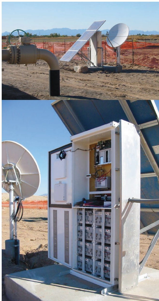
Figure 2. Refiners use economical VSAT systems for remote pipeline monitoring at thousands of sites.

Satellite services have long been an established part of the communications mix for oil and gas companies operating in areas that are remote from fixed line and wireless networks. At unmanned sites, the latest mobile solutions can efficiently process data gathered by sensors and actuators, enabling near real time status reporting on wells, rigs and other equipment in the field through SCADA applications.