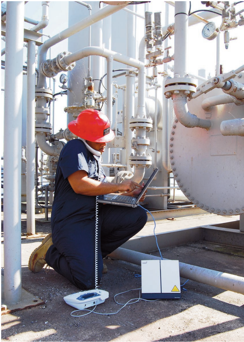
Figure 1. New mobile broadband satellite systems offer voice and high speed data connectivity via compact, lightweight terminals.

This year, more than ever before, leading energy companies are placing greater emphasis on centralised IT functions, with an urgent need to push more sophisticated business and operational applications to the field. They demand high uptime of core communications networks that can support global operations. The challenges are often made more complex by the need to guarantee consistent treatment of data through the application of well defined QoS criteria, as the data is cross mapped through multiple subnetworks along the corporate network.